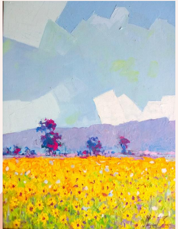
14" x 18" Acrylic on canvas 910,000 MMK