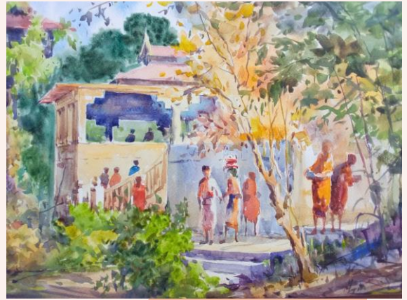
11" x 15" Watercolor on canvas 260,000 MMK