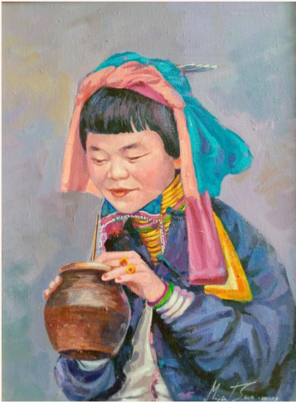
11" x 18" Acrylic on canvas 650,000 MMK