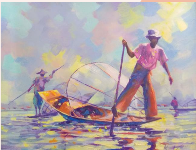
10" x 12" Acrylic on canvas 650,000 MMK