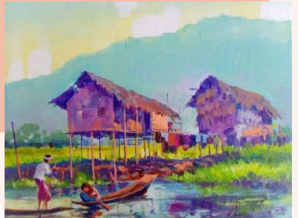
10" x 12" Acrylic on canvas 650,000 MMK