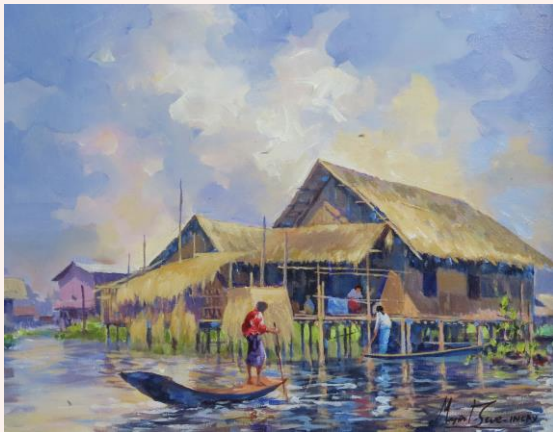
11" x 15" Acrylic on canvas 650,000 MMK