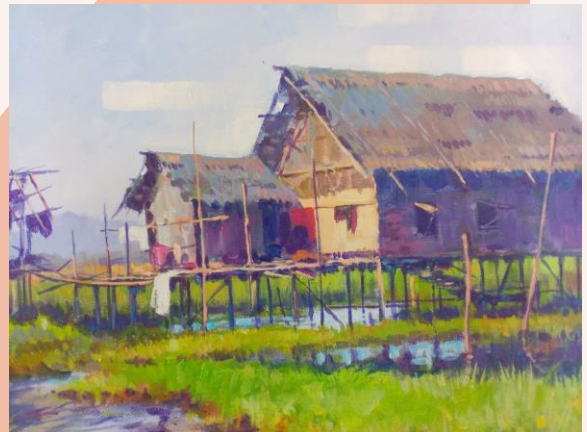
10" x 12" Acrylic on canvas 650,000 MMK