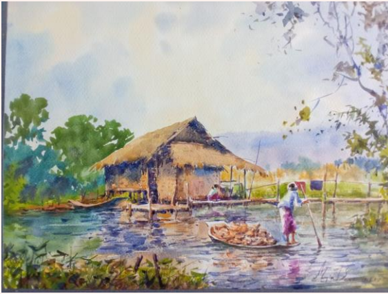
11" x 15" Watercolor on canvas 260,000 MMK