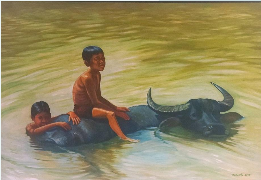
TIN MYINT MAUNG 20" x 30" Acrylic on Canvas 1,040,000MMK

If any of these paintings speak to you... don't miss your chance!