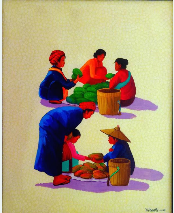
TIN MYINT MAUNG 16" x 19" Acrylic on canvas 780,000 MMK