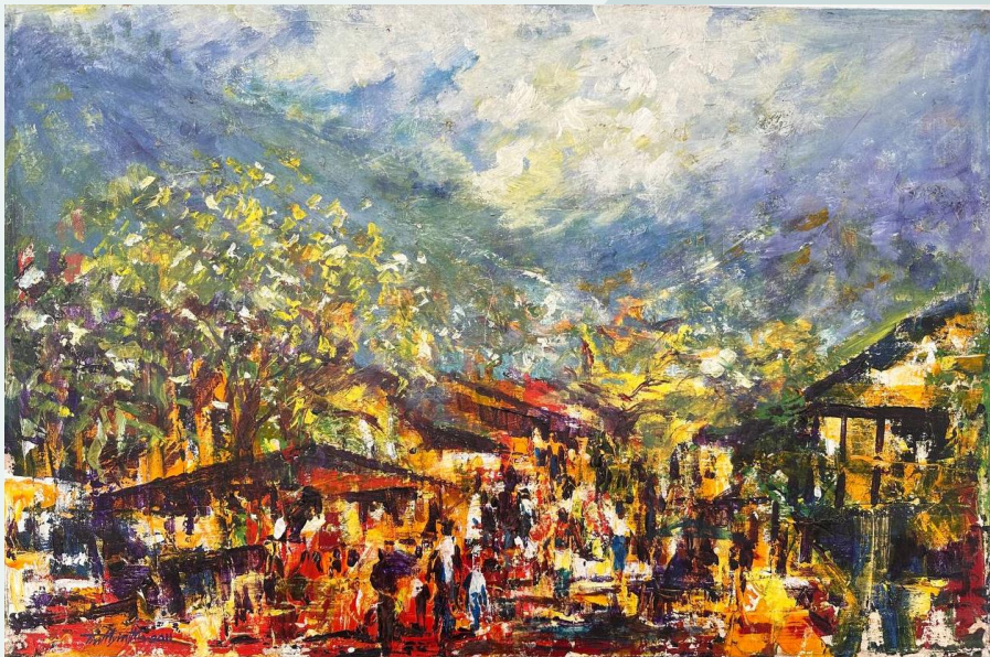
TIN MYINT MAUNG 30" x 20" Acrylic on canvas 1040,000 MMK

If any of these paintings speak to you... don't miss your chance!