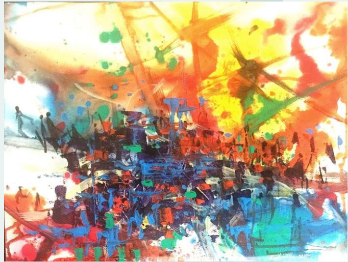
TIN MYINT MAUNG 15" x 20" Watercolor on Canvas 650,000 MMK