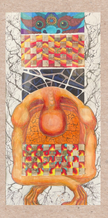
Title - Peace Pattern Artist - Ko So Size - 25 x 50 cm Medium - Mixed Media