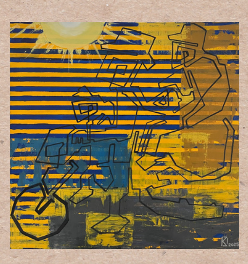
Title - Strugglymily Artist - Khine Mye Size - 60 x 60 cm Medium - Acrylic on Canvas

Title - Psyche Artist - Sai Moon Size - 40 x 40 cm Medium - Acrylic on Canvas