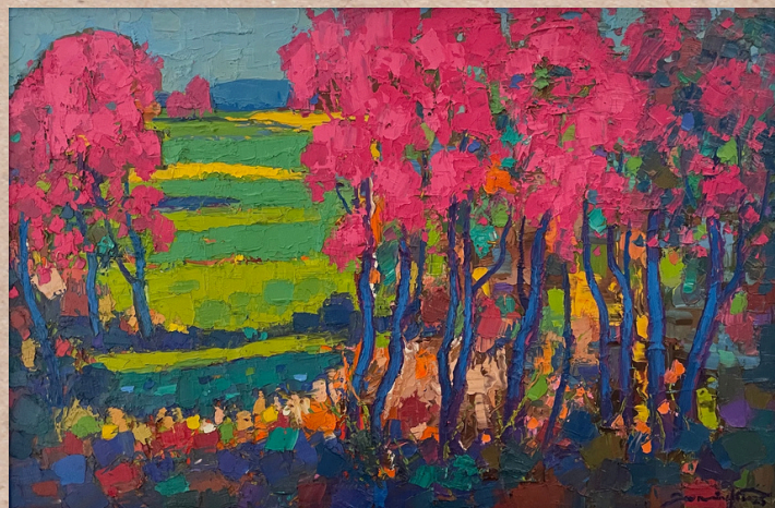
Title - Cherry