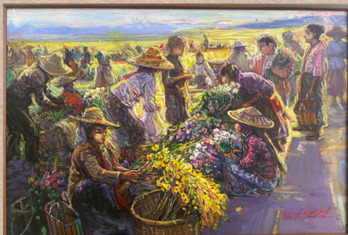
Title - Inle Kaung Taing Market Day