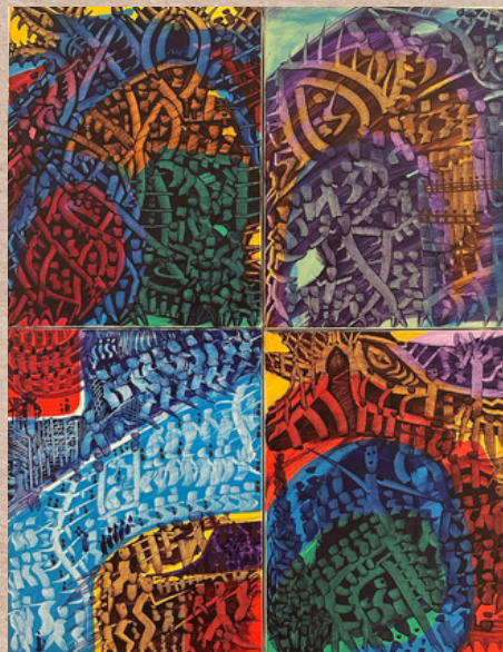
Title - The Shapes of The Past Artist - Myo Thuzar Size - 70 x 90 cm (35 x 45 each painting) Medium - Acrylic on Canvas