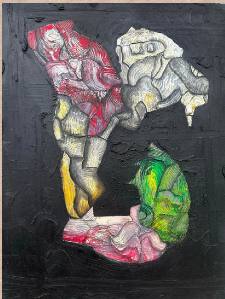
Artist - Rack Aid @ Gu Gu Size - 45 x 61 cm Medium - Mixed Media