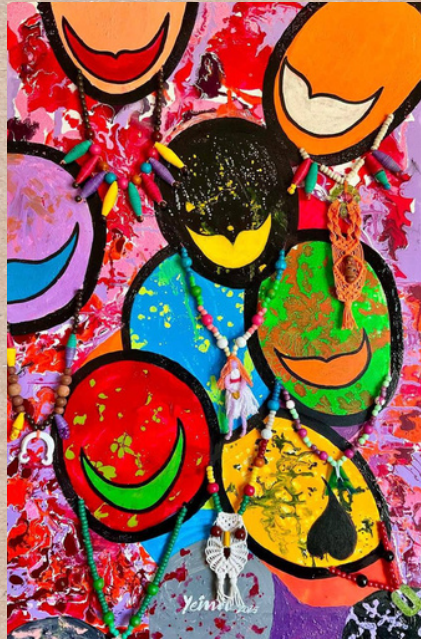
Title - Smiling Face & Shining Necklace Artist - Yeinn Kham Size - 121 x 151 cm Medium - Mixed Media