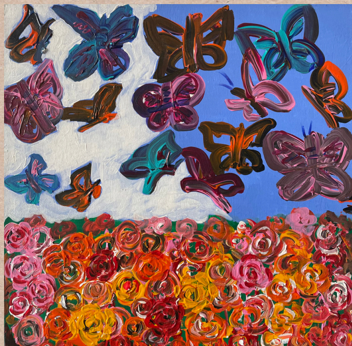
Title - Psyche