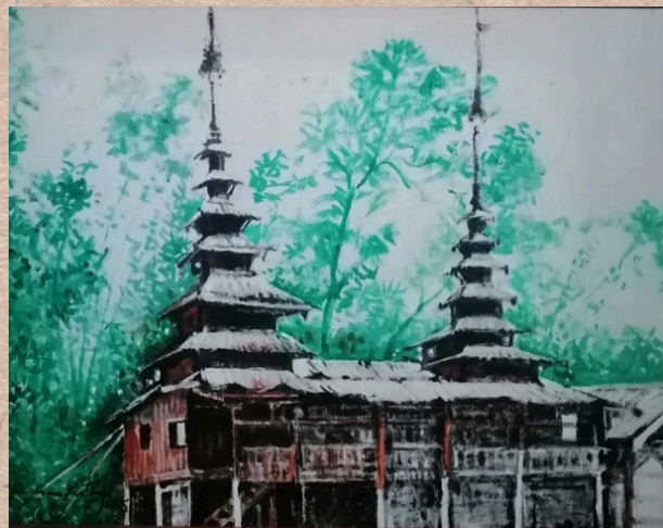
Title - Donpae Yin Hill and Ancient Artist - Myint Kyi Size - 35 x 45 cm Medium - Mixed Media