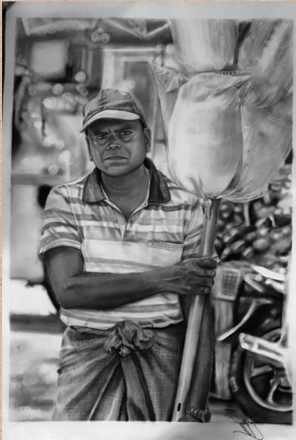
Title - U Bo Maung Artist - Kyaw Myo Han Size - 38 x 56 cm Medium - Pencil on Paper