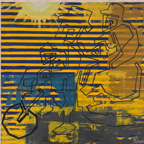
Title - Strugglymily Artist - Khine Mye Size - 60 x 60 cm Medium - Acrylic on Canvas