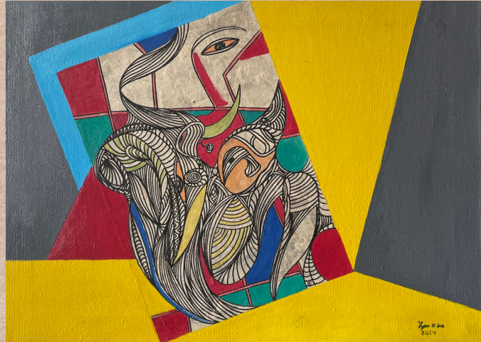
Title - Survival Artist - Kyaw Naing Soe Size - 36 x 46 cm Medium - Mixed Media